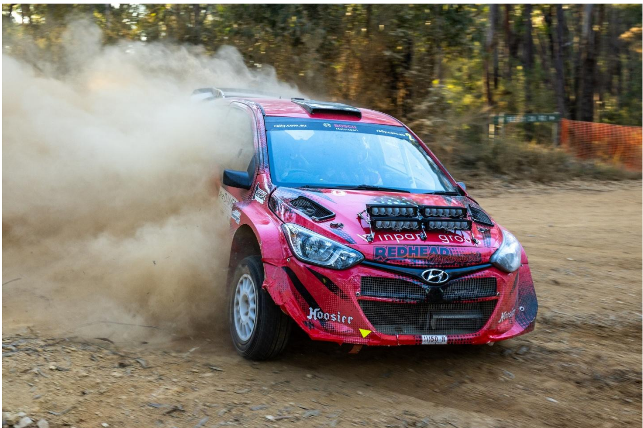
Josh Redhead and Ray Winwood-Smith – Winners of the 2024 Damesa Industries Rally.